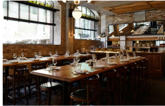
THE OYSTER ROOM

Here is where some of Australia's freshest oysters are shucked – right before your very eyes! An event in The Oyster Room is the perfect opportunity to get up and close to the shucking action. This space is a semi exclusive area within our Main Bar – offering beautiful high tables designed for long lunches, celebrations, and shared feasting.