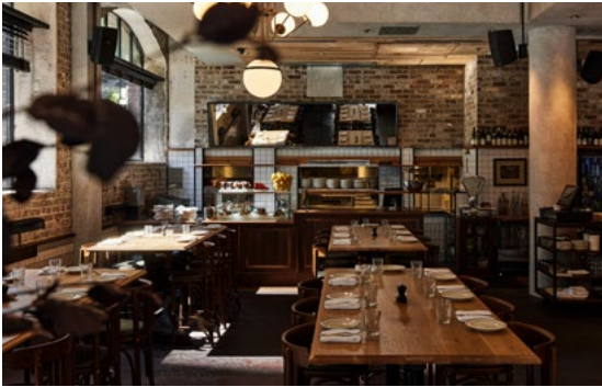
THE OYSTER ROOM

Positioned within the heart of our Main Bar, The Oyster Room is an energetic, semi-exclusive space ideal for standing cocktail-style events. Guests are immersed in the theatre of live oyster shucking and bar service. It's a lively setting for relaxed mingling, celebratory drinks and shared seafood-focused fare.